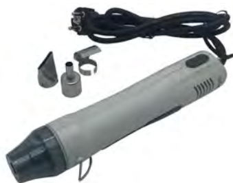
RND 555-00003 Low Temperature Mini Hot Air Gun