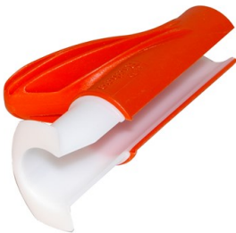
RND 465-01347 Cable Installation Tool