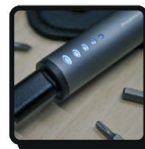
Complete, blue light on