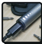
Charging, white light on