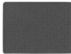
Base foam 1 x 15mm