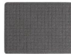
Cubed foam 3 x 60mm