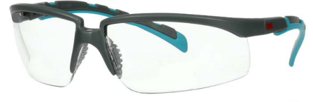
S2001SGAF-BGR Lens: Clear | Frame Colour: Grey/Blue-Green