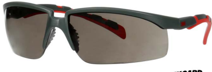
S2002SGAF-RED Lens: Grey | Frame Colour: Grey/Red