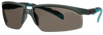
S2002SGAF-BGR Lens: Grey | Frame Colour: Grey/Blue-Green