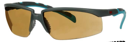
S2005SGAF-BGR Lens: Brown | Frame Colour: Grey/Blue-Green