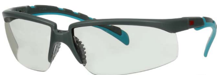
S2007SGAF-BGR Lens: I/O Grey | Frame Colour: Grey/Blue-Green