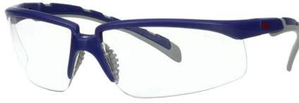
S2001AF-BLU Lens: Clear | Frame Colour: Blue/Grey