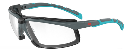
Foam gasket S2001SGAF-BGR-F Lens: Clear | Frame Colour: Grey/Blue-Green

Readers and IR Shade models due end 2019 3x reader pairs +1.5, +2, +2.5 and 3x IR pairs IR 1.7, IR 3 and IR 5