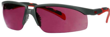
S2024AS-RED Lens: Red Mirror | Frame Colour: Grey/Red