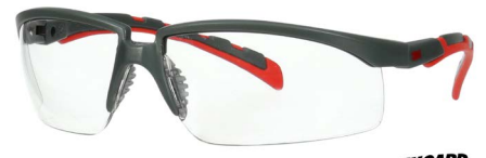
S2001SGAF-RED Lens: Clear | Frame Colour: Grey/Red