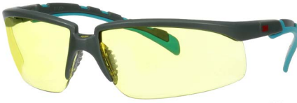
S2003SGAF-BGR Lens: Amber | Frame Colour: Grey/Blue-Green