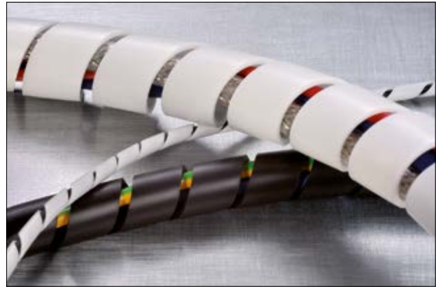
Spiral binding SBPEFR is available in a wide range of diameters and in colours black and white.