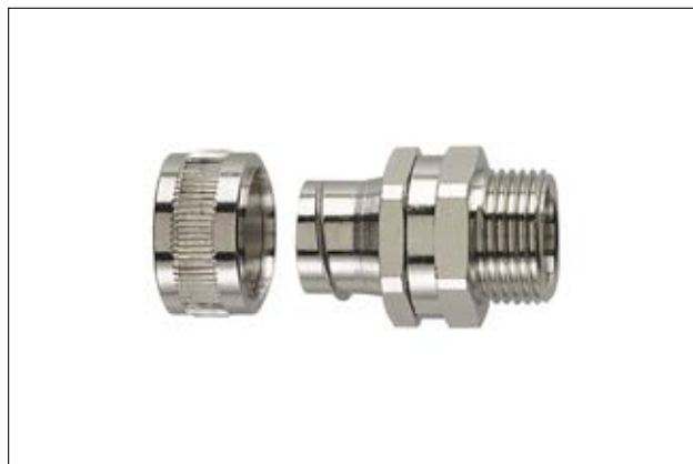
HeliaGuard SC-SM Swivel External Thread.