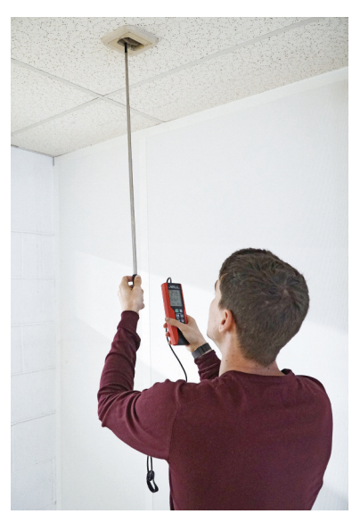
SEFRAM 9862 telescopic rod