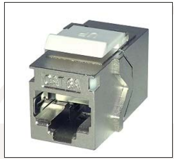
Category 6A Shielded Keystone Panel Mount Coupler (SGACK2S, SGACK2S-24)