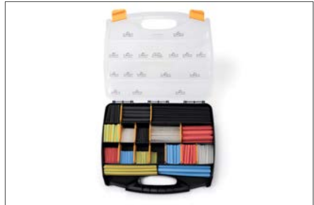
ShrinKit 321 Universal - 975 pcs 3:1 heat shrink assortment.