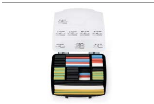
ShrinkKit 321 Universal Basic - 177 pcs 3:1 heat shrink assortment.