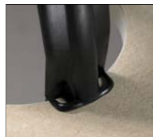
Bearing wings ensure that the spacer locates securely on the plasterboard.