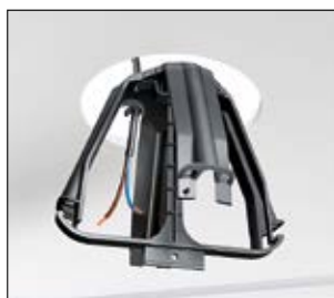
1. Use the delivered tool to install SpotClip in the fixing hole as easy as possible.