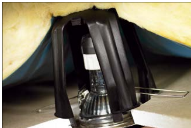
SpotClip-II ensures reliability and safety of lighting installations.

www.HellermannTyton.co.uk/SpotClip-I-cat22