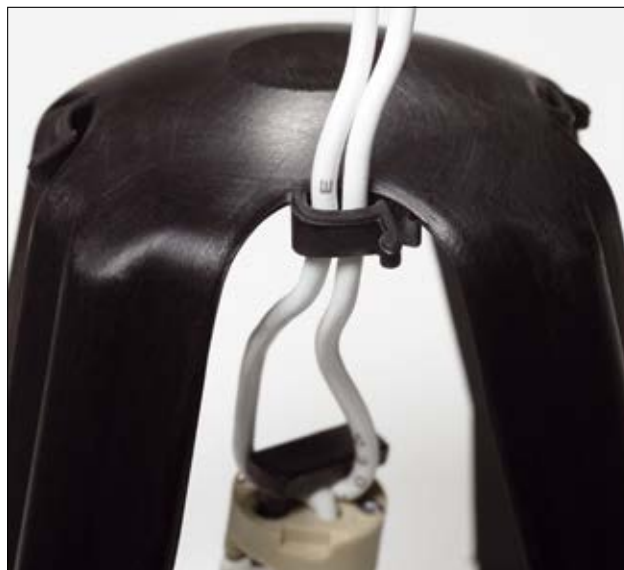
Cable retainers on the heat protection top hold the supply cable in place.