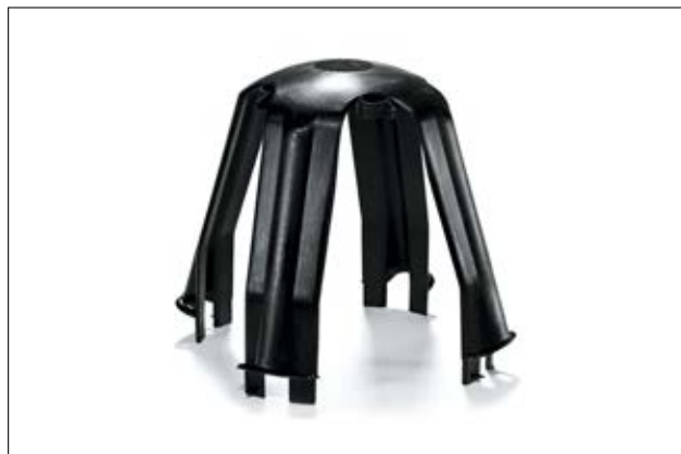
Optimization of 4 fastening feet.