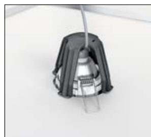
3. Start the installation of the downlight in a safe way.