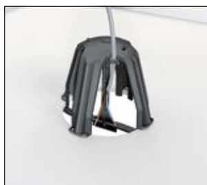
2. Push the spikes into the plasterboard to prevent shifting and disconnect the tool.