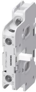
Auxiliary switch block for size 2...14 1st auxiliary switch block left or right