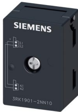
AS-Interface distributor compact for AS-i profile cable IP 67/68/69K, max. 8 A