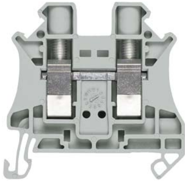
Terminal, screw terminal, through-type terminal, 6 mm 2 , gray