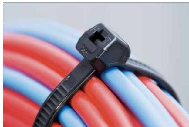
Outside serrated OS-Series cable tie with smooth surface to the bundle.