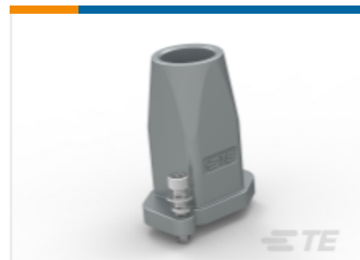
TE Part #T1927031120-000 H3APR-MTGSW-M20