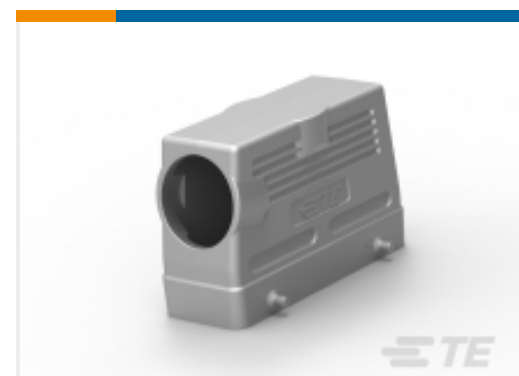
TE Part #T1230240140-000 H24B-TSH-M40