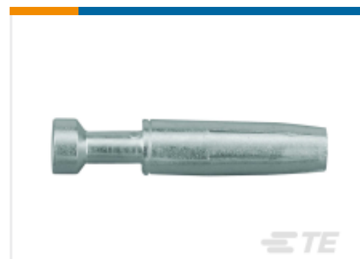
TE Part #T2030002015-000 CEF-1.5