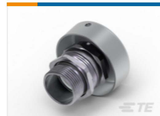
TE Part #T3900250250-000 M25X1.5 VA-25-LM