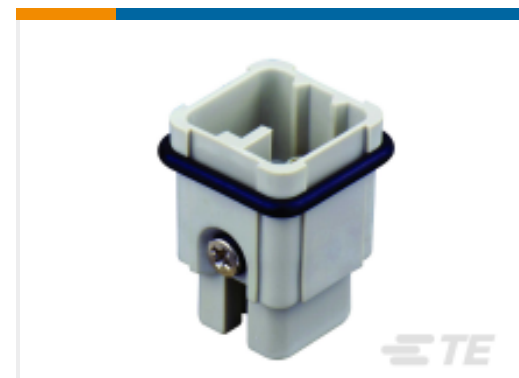
TE Part #T2020072101-000 HD-007-M