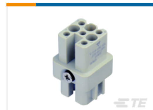
TE Part #T2020072201-000 HD-007-F