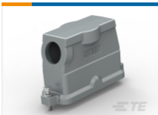
TE Part #T1912241140-000 H24BPR-TSHC-M40