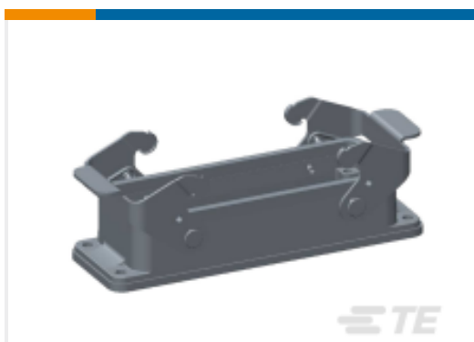
TE Part #T1410242000-000 H24B-AG