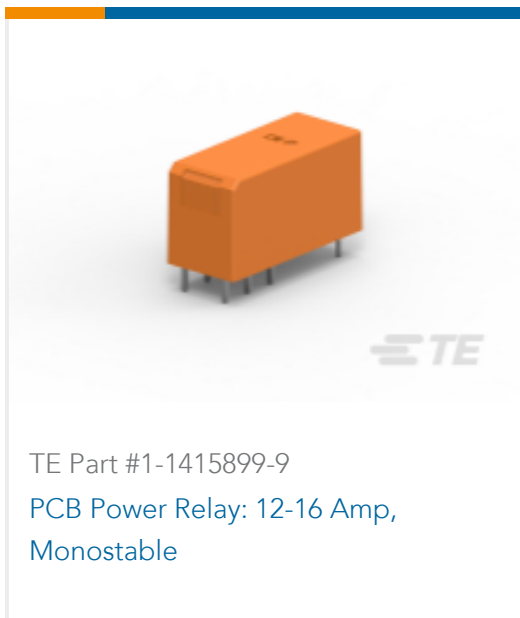
TE Part #1-1415899-9 PCB Power Relay: 12-16 Amp, Monostable