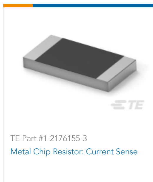
TE Part #1-2176155-3 Metal Chip Resistor: Current Sense