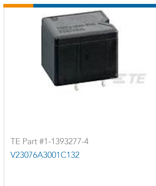
TE Part #1-1393277-4 V23076A3001C132