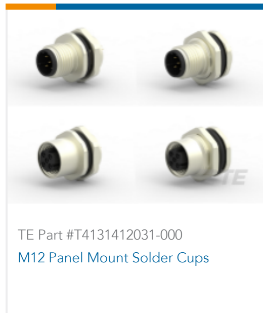
TE Part #T4131412031-000 M12 Panel Mount Solder Cups