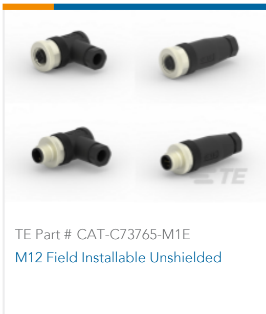
TE Part # CAT-C73765-M1E M12 Field Installable Unshielded