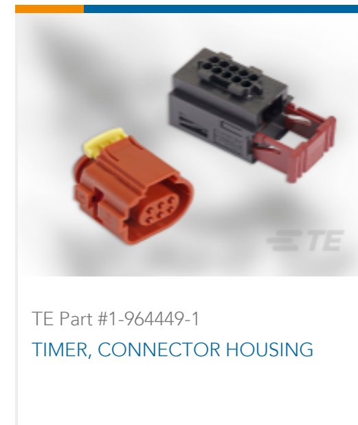
TE Part #1-964449-1 TIMER, CONNECTOR HOUSING