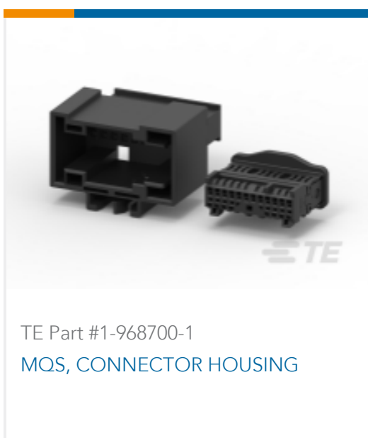
TE Part #1-968700-1 MQS, CONNECTOR HOUSING