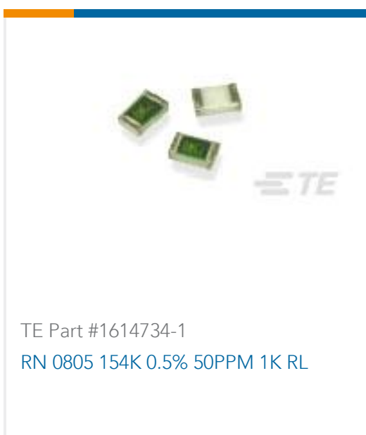
TE Part #1614734-1 RN 0805 154K 0.5% 50PPM 1K RL