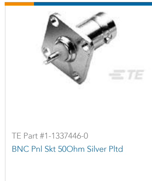
TE Part #1-1337446-0 BNC Pnl Skt 50Ohm Silver Pltd