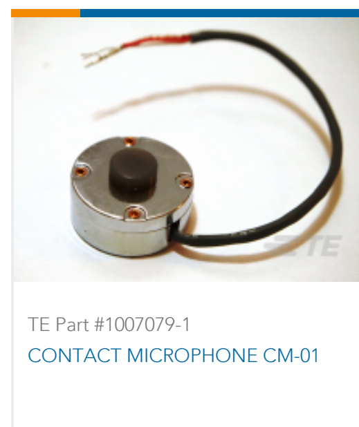
TE Part #1007079-1 CONTACT MICROPHONE CM-01