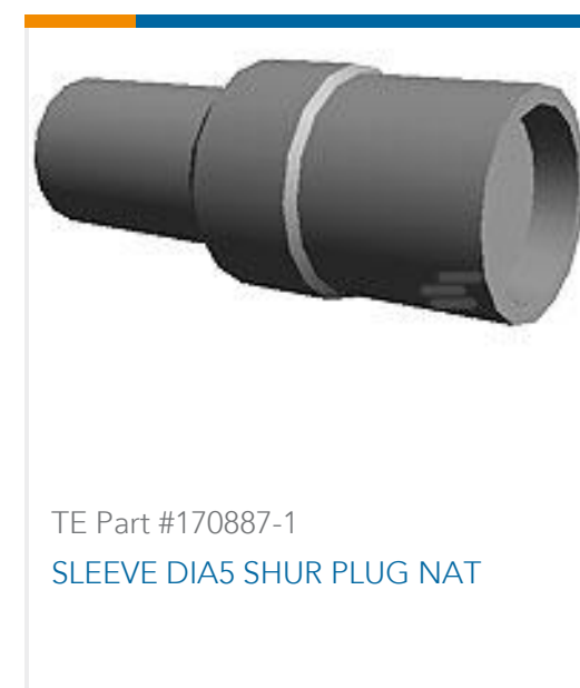
TE Part #170887-1 SLEEVE DIA5 SHUR PLUG NAT