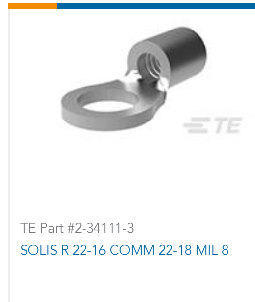
TE Part #2-34111-3 SOLIS R 22-16 COMM 22-18 MIL 8