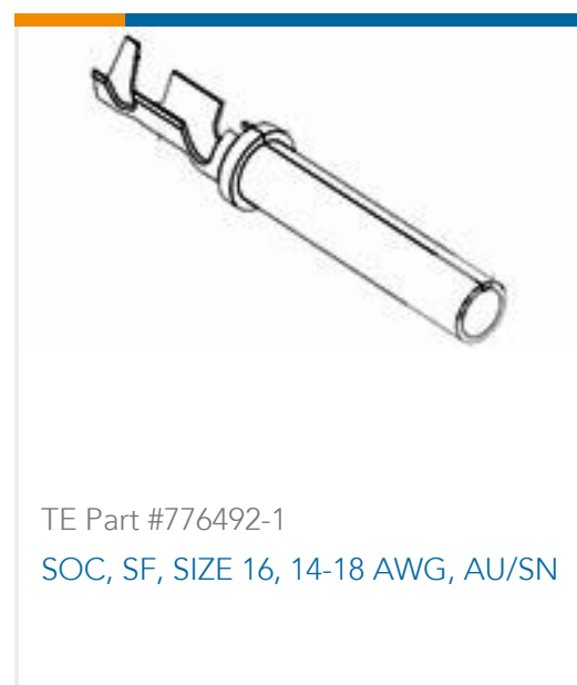
TE Part #776492-1 SOC, SF, SIZE 16, 14-18 AWG, AU/SN