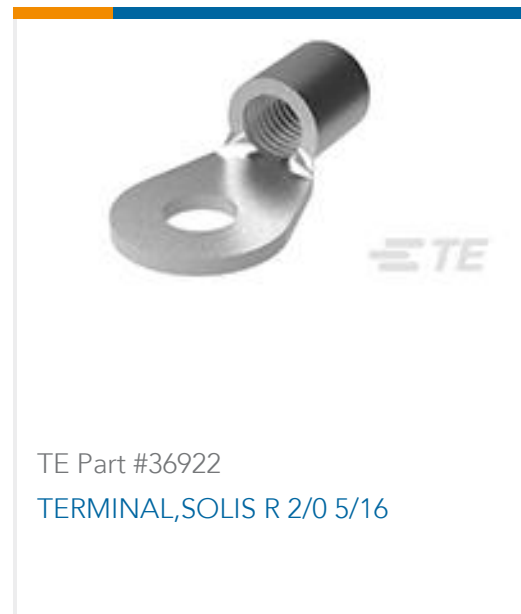
TE Part #36922 TERMINAL, SOLIS R 2/0 5/16