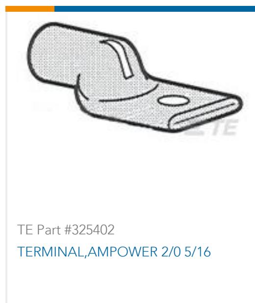
TE Part #325402 TERMINAL, AMPPOWER 2/0 5/16