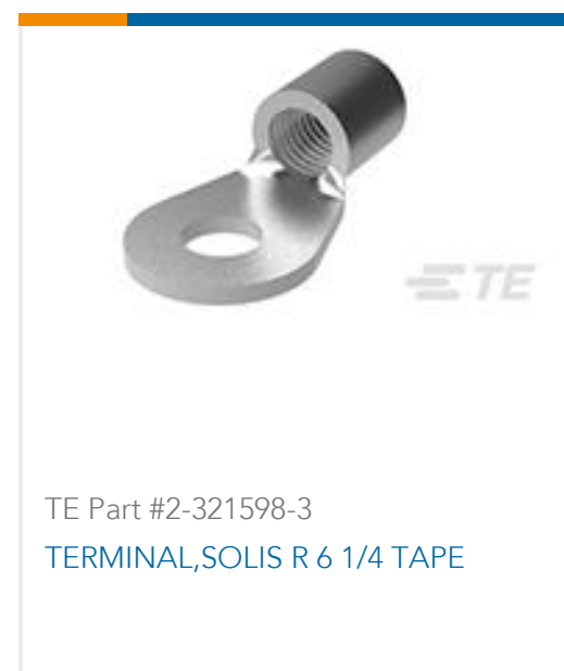
TE Part #2-321598-3 TERMINAL, SOLIS R 6 1/4 TAPE