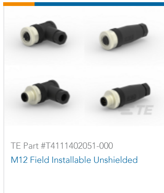
TE Part #T4111402051-000 M12 Field Installable Unshielded