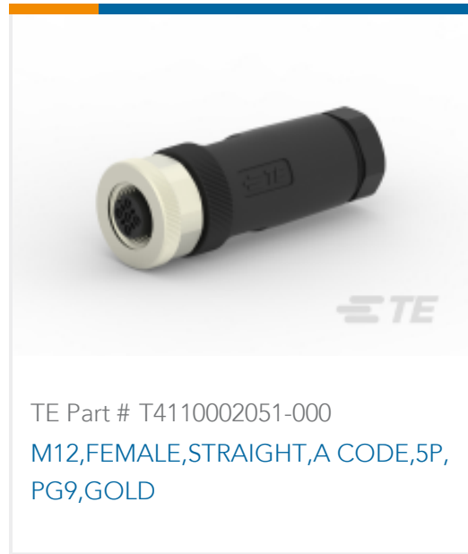
TE Part # T4110002051-000 M12, FEMALE, STRAIGHT, A CODE, 5P, PG9, GOLD