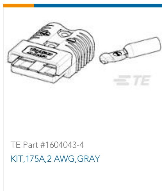
TE Part #1604043-4 KIT, 175A, 2 AWG, GRAY