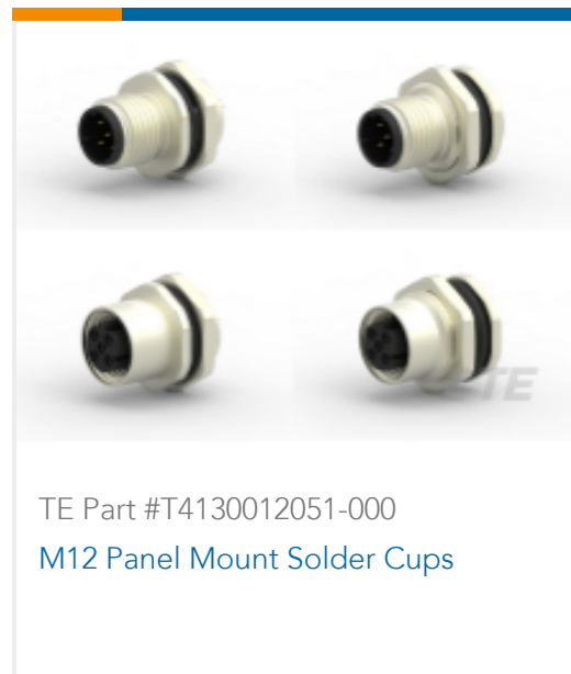
TE Part #T4130012051-000 M12 Panel Mount Solder Cups