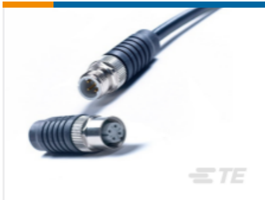
TE Part #1-2823447-1 M12 STRAIGHT CRIMPED STRAIN RELIEF