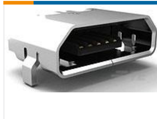
TE Part #2134536-2 MICRO USB, TYPE A/B, GRAY