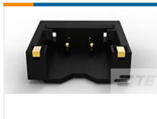
TE Part #1909782-1 BOARD TO WIRE WAFER 1.2MM TOP ENTRY