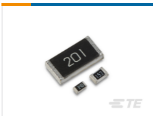
TE Part #2176325-6 CRGP 0402 27R 1%