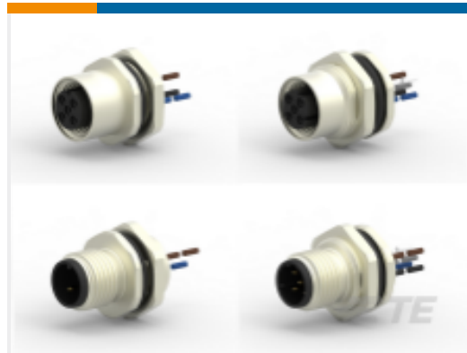
TE Part #T4171020008-001 M12 Panel Mount Wire