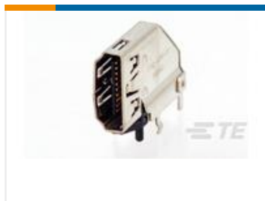
TE Part #2007435-3 Std HDMI, Flag, T/H