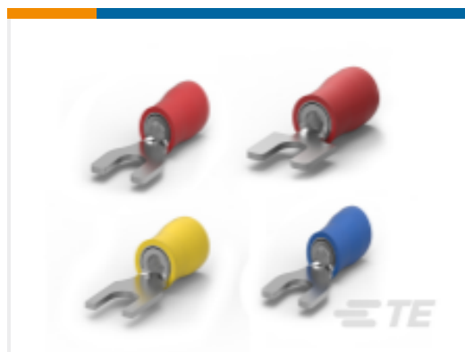
TE Part #130537 PIDG SPADE TONGUE TERMINALS