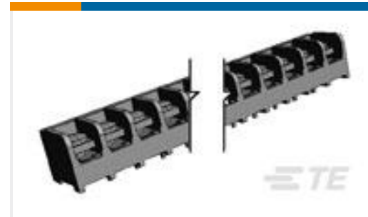
TE Part #7-1437653-4 6PCV-15-006=6PCV ASSEMBLY