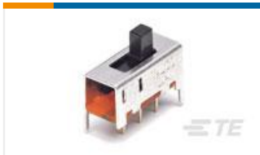
TE Part #1825261-2 MSS2200G04=DPDT SL SW VERT AU