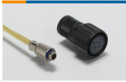
Standard Circular Connectors(520)