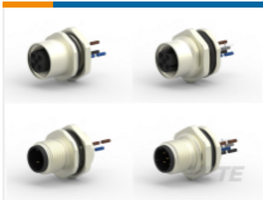
TE Part #T4171010005-001 M12 Panel Mount Wire