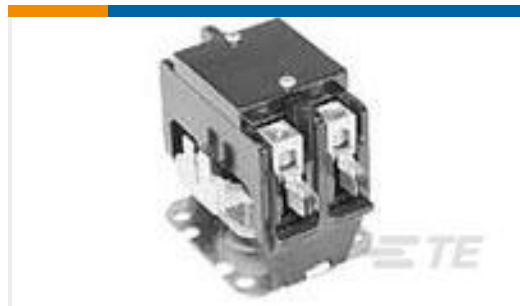
TE Part #7-1611004-4 3100-20U18999CL=40A 2P 208/240