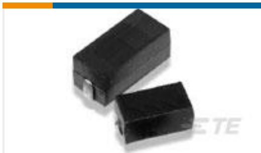
TE Part #3-1879021-1 SMW3 1R8 5%