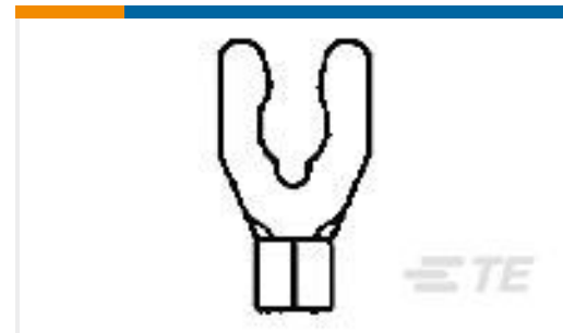
TE Part #53123-2 TERMINAL,SOLIS SPR SPD 16-14 6