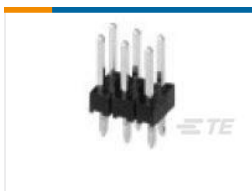
TE Part #104433-3 06 MODII HDR DRST B/A W/HD