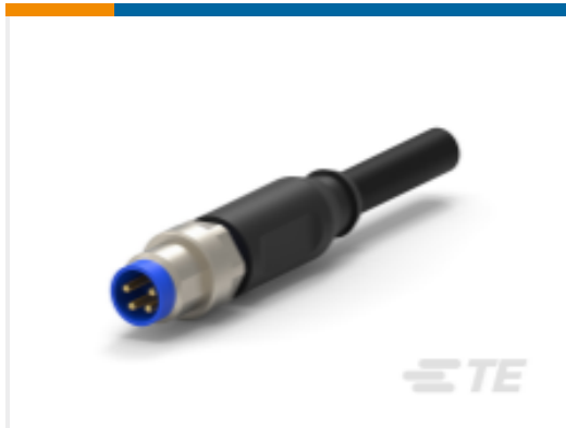
TE Part #1-2273004-1 M8 MALE STRAIGHT PIGTAIL