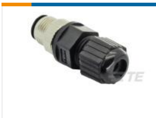
TE Part #1838275-4 M12 Fld Ser CONN. Male Pin Sldr