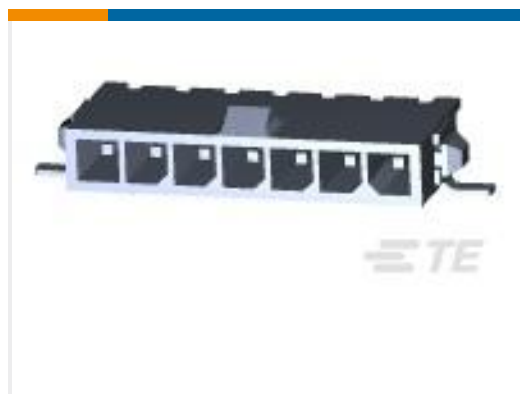
TE Part #2-1445057-7 MICRO MNL HDR ASSY SINGLE ROW