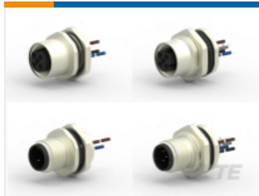
TE Part #T4171330012-001 M12 Panel Mount Wire