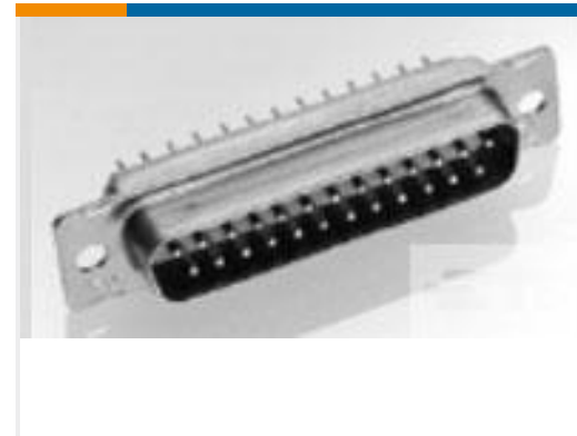
TE Part #1757823-9 AMPLIMITE,ASY,PLUG,STD,90,ZN,3,CT