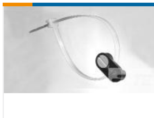
TE Part #1-350087-0 CABLE TIE MOUNT BASE, BLACK