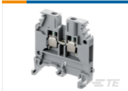
TE Part #1SNA105031R1400 M4/6