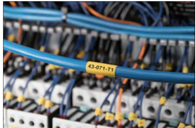
TLFX- high performance halogen free heat shrink tube.