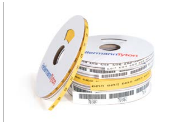
TLFX – European rail approved heat shrink marker material.