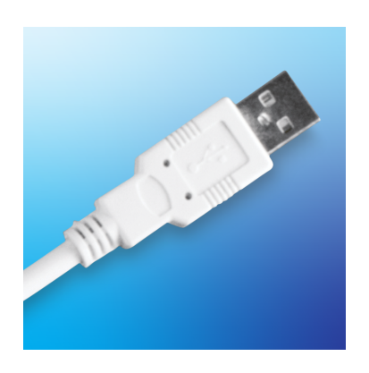
USB ne USB to serial adapter

The USB to serial adapter is compatible with USB 1.1, 2.0 and 3.0 devices.