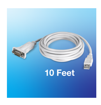
10 Ft. Flexible Cable

Connect a RS-232 serial devices, such as switches, modems or printers, to standard USB ports on laptops and desktops.