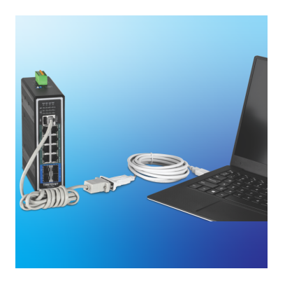
RS-232 Serial Connector

The USB to serial adapter is compatible with USB 1.1, 2.0 and 3.0 devices.