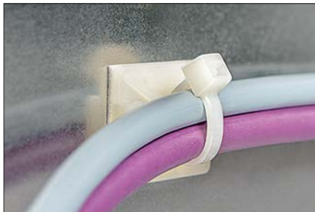
TY-Series mounts with rectangle design.