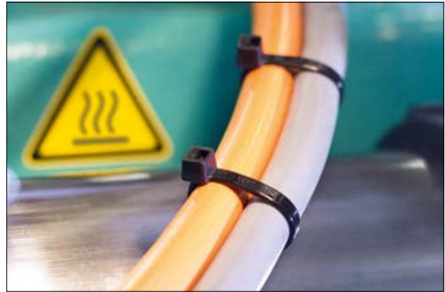
Heat stabilised T-Series cable ties up to +105 °C.