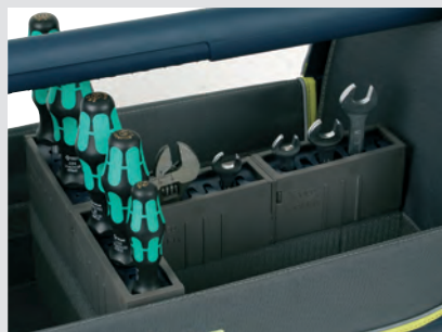
Tool Fix can be used as a divider for Tool Taco XL.