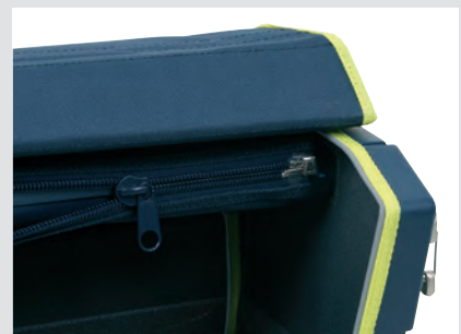
Removable - to use when needed. Zipper for easy fitting.