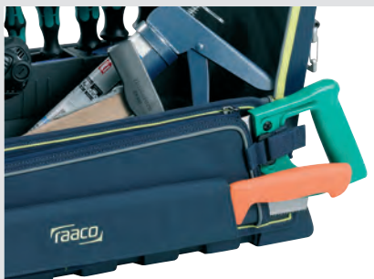
Two pouches in one available.