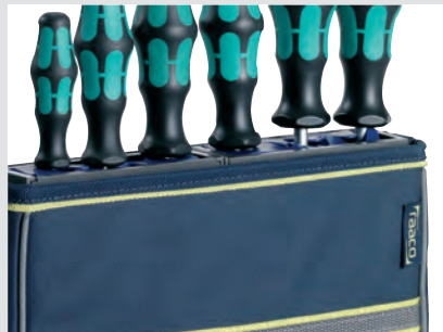
Strong velcro for mounting inside of Tool Taco or Open Pouch.