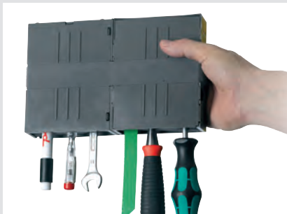
Patented Tool Fix system to hold the tools in place.