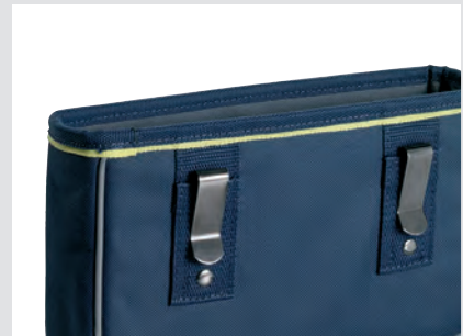
With strong clips for easy mounting on Tool Taco.