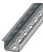
DIN rail, material: Galvanized, perforated, height 15 mm, width 35 mm, length: 2 m

DIN rail perforated - NS 35/15 ZN PERF 2000MM - 1206599