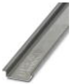
DIN rail, unperforated, Width: 35 mm, Height: 7.5 mm, Length: 2000 mm, Color: silver

DIN rail, unperforated - NS 35/ 7,5 AL UNPERF 2000MM - 0801704