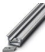
DIN rail, deep drawn, high profile, unperforated, 1.5 mm thick, material: aluminum, height 15 mm, width 35 mm, length 2000 mm

DIN rail, unperforated - NS 35/15 AL UNPERF 2000MM - 1201756