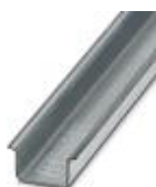
DIN rail, material: Galvanized, unperforated, height 15 mm, width 35 mm, length: 2 m

DIN rail, unperforated - NS 35/15 ZN UNPERF 2000MM - 1206586