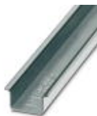
DIN rail 35 mm (NS 35)

DIN rail - NS 35/15 WH UNPERF 2000MM - 1204135