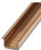
DIN rail, material: Copper, unperforated, 1.5 mm thick, height 15 mm, width 35 mm, length: 2 m

DIN rail, unperforated - NS 35/15 CU UNPERF 2000MM - 1201895