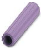
Insulating sleeve, Color: violet