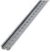
DIN rail 35 mm (NS 35)

DIN rail perforated - NS 35/ 7,5 WH PERF 2000MM - 1204119