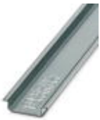
DIN rail 35 mm (NS 35)

DIN rail - NS 35/ 7,5 WH UNPERF 2000MM - 1204122