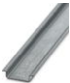
DIN rail, material: Galvanized, unperforated, height 7.5 mm, width 35 mm, length: 2 m

DIN rail, unperforated - NS 35/ 7,5 ZN UNPERF 2000MM - 1206434