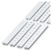
Zack marker strip, can be ordered: Strip, white, labeled according to customer specifications, Mounting type: Snap into tall marker groove, for terminal block width: 10.2 mm, Lettering field: 10.15 x 10.5 mm