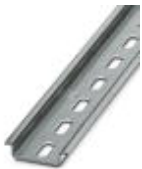
DIN rail, material: Galvanized, perforated, height 7.5 mm, width 35 mm, length: 2 m

DIN rail perforated - NS 35/ 7,5 ZN PERF 2000MM - 1206421