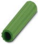
Insulating sleeve, Color: green