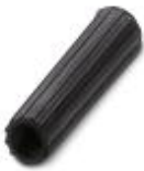
Insulating sleeve, Color: black