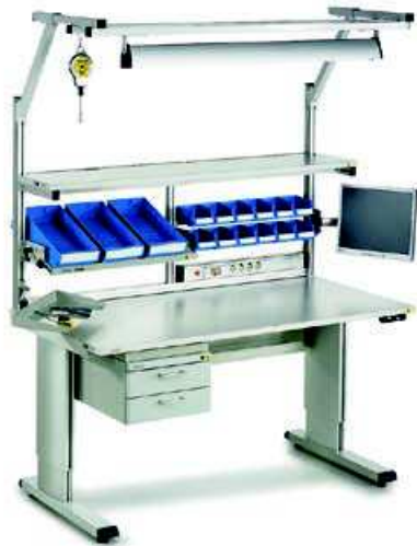
WB electric adjustable workbench