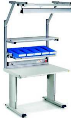
WB allen key adjustable workbench