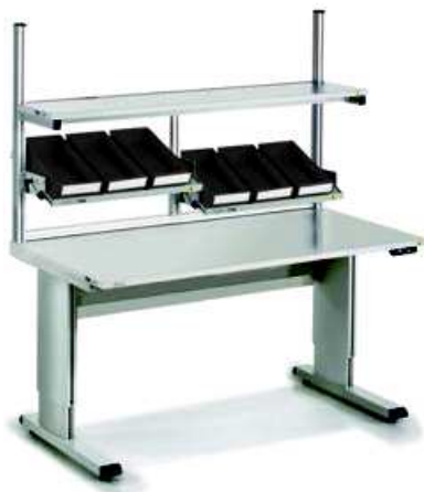
WB electric adjustable workbench ESD