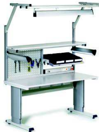
WB allen key adjustable workbench ESD