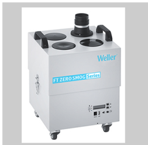
Solder fume extractors