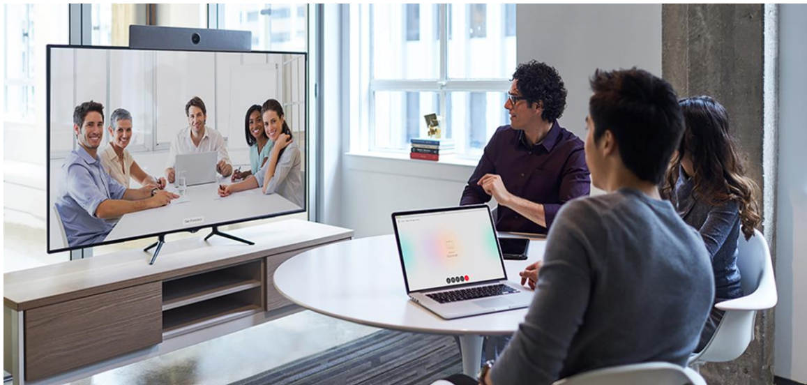
Figure 1. Cisco Webex Room Kit in small room scenario

The Room Kit – which includes camera, codec, speakers, and microphones integrated in a single device – is ideal for rooms that seat up to seven people. It offers sophisticated camera technologies that bring speaker-tracking capabilities to smaller rooms. The product is rich in functionality and experience but is priced and designed to be easily scalable to all of your small conference rooms and spaces – whether registered on the premises or to Cisco Webex.