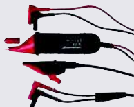
Kelvin Clip & Probe

Kelvin clips are used for connecting low impedance resistors (e.g. contact resistors, shunts etc.) to an ohmmeter with 4-wire connection. This allows for compensation of cable resistance.