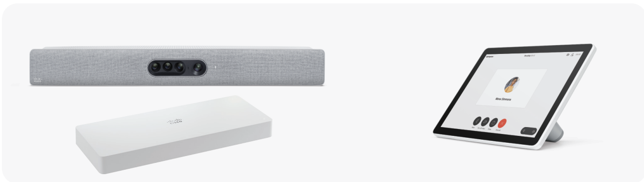
Figure 2. Default components of the Webex Room Kit Plus: Webex Codec Plus, Webex Quad Camera, Webex Room Navigator