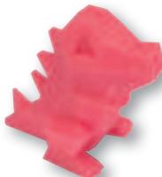
Low-Poly Torodile by FLOWALISTIK