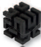
Hilbert's Cube By fbuser