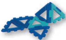
Customizable hinge/snap Octahedron net by mathgrnt