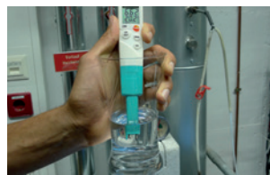
Ideally suitable for monitoring heating system water according to VDI 2035.