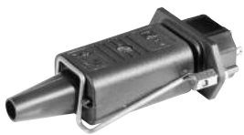
Cord retaining kits