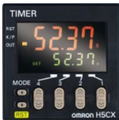
- Timer - Twin Timer