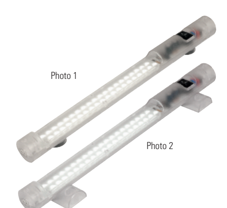
Photo 1: Lamp LED 025 with magnet fixing Photo 2: Lamp LED 025 with screw fixing