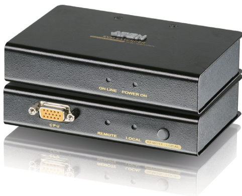
CE250AR (Remote unit)