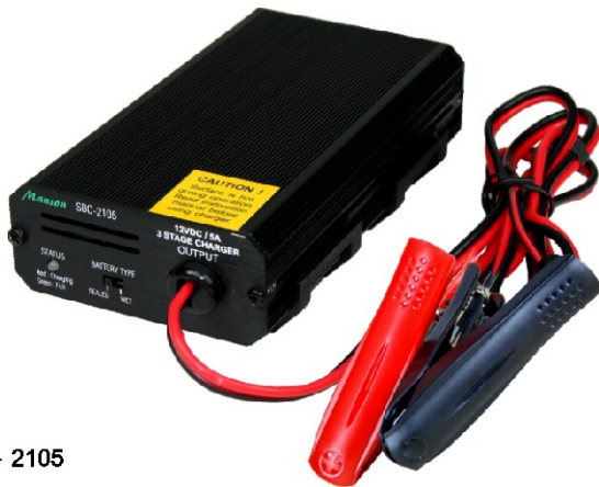
SBC - 2105