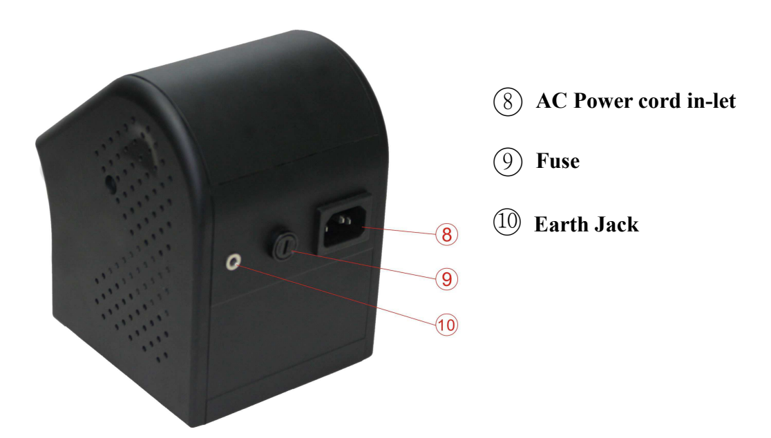
Fig. 1 Soldering iron introduction